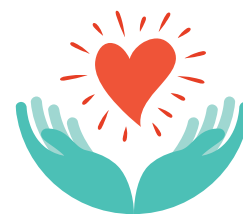
Serving in Love