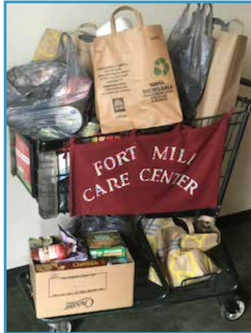
Serving In Love: An overflowing cart of food and toiletry items, 175 pounds, mostly from VBS participation, were delivered to the Fort Mill Care Center in June.

The FMCC is a non-profit that strives to improve the lives of clients by providing assistance with food, fuel, power, heat, and medicine. PUMC supports the Care Center throughout the year with donations left in the cart in the Coffee Connections Room. Items that we need the most are Cereal, Grits, Canned meat, Canned Stews and Chili, Spaghetti Sauce. Snacks: chips, crackers, nuts, popcorn, granola bars, Meals in a box like Hamburger Helper, Chicken Helper, and Tuna Helper.