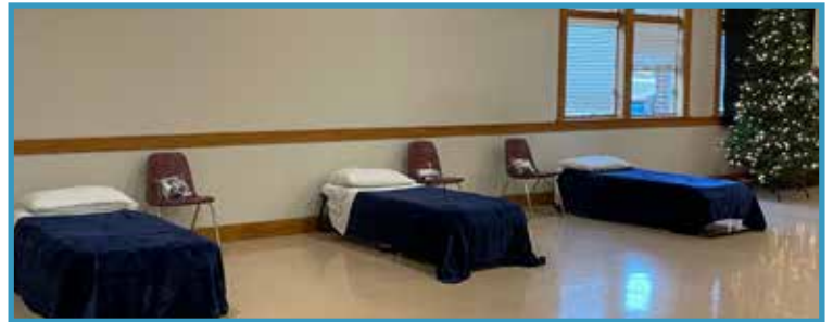
Serving In Love: Help us give a warm bed and nutritious food to men in our community this winter.

We are also collecting travel sized toiletry items for the men. Please donate the following in the Coffee Connections Room: shave cream, razors, deodorant, chap stick, ear plugs, granola bars, and dental floss.