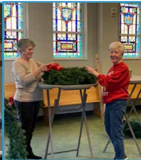
Serving In Love: Thank you to everyone who helped to decorate the church for Advent and Christmas!