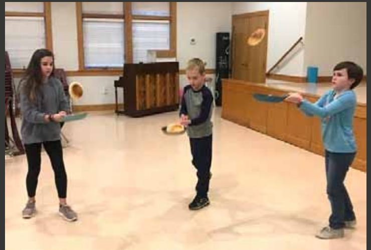
Growing in Love: There is a lot of skill to flipping pancakes. Just ask our 3 champions from the Shrove Pancake Flipping Contest!