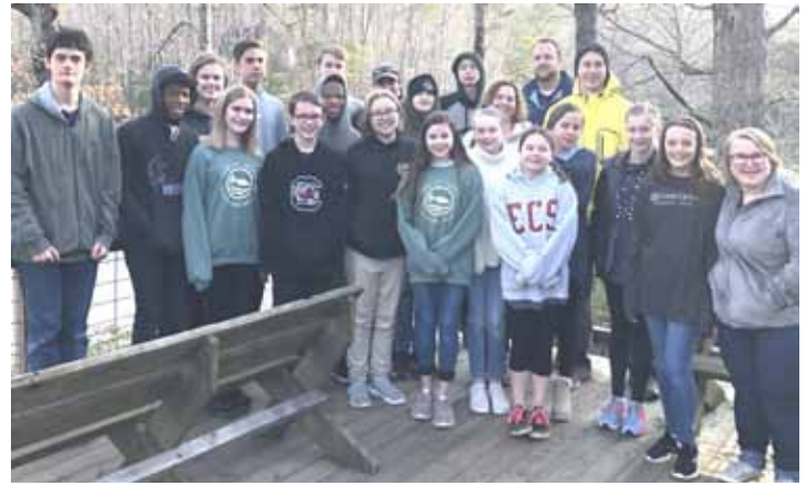
Growing in Love: Our youth build meaningful bonds and grow in faith at Look Up Lodge, Traveler's Rest, SC.