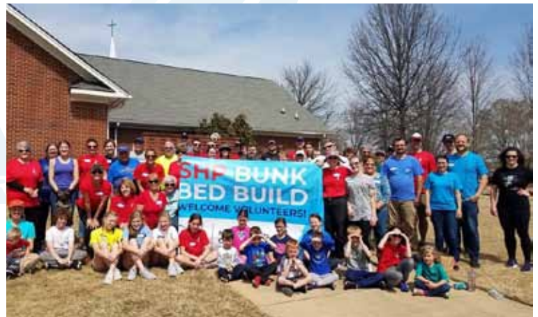
Serving In Love: We are the hands and feet of Christ in action! Helping to fulfill the Sleep In Heavenly Peace mission that "No Kid Sleeps On A Floor In Our Town", young and old worked hand in hand to build bunk beds for local children.