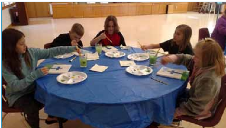
Growing In Love: Children are able to express themselves artistically at our first painting party.

A big thank you to everyone who came out last month to participate in our kids' painting event. We had 25 children who came out on a Saturday morning to enjoy cookie treats and learn about the resurrection of Jesus in a fun and creative way.