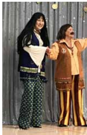
Growing in Love: Senior Friends celebrated St. Patrick's Day with corned beef and cabbage, and enjoyed the Carolina Copy Cats bringing back memories of 'Sonny & Cher'.