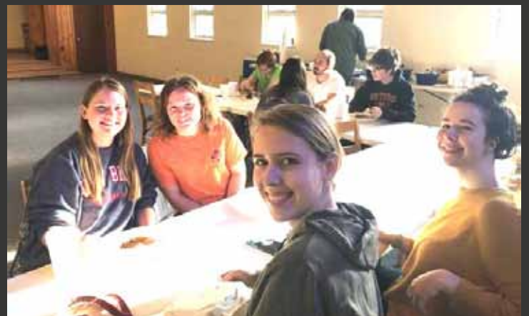
Growing in Love: Every spring the UMW takes a home cooked meal to the students of Winthrop Wesley.