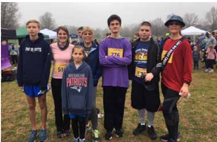
Serving In Love: We ran in the Joe Davis Run for Recovery to aide those suffering with substance use disorders.

In March, some of our "Soul-Mates" running group participated in the Joe Davis Run for Recovery in Fort Mill. Several participants placed among the top three in their age groups in the both the 5K and 10K events. Proceeds from the race help Keystone Substance Abuse Services, a local non-profit promoting health, hope and healing to those impacted by substance abuse. Look for Soul-Mates to continue to meet in the coming weeks to have fun while enjoying God's beautiful outdoors and striving to improve our physical fitness. All are welcome to join us!